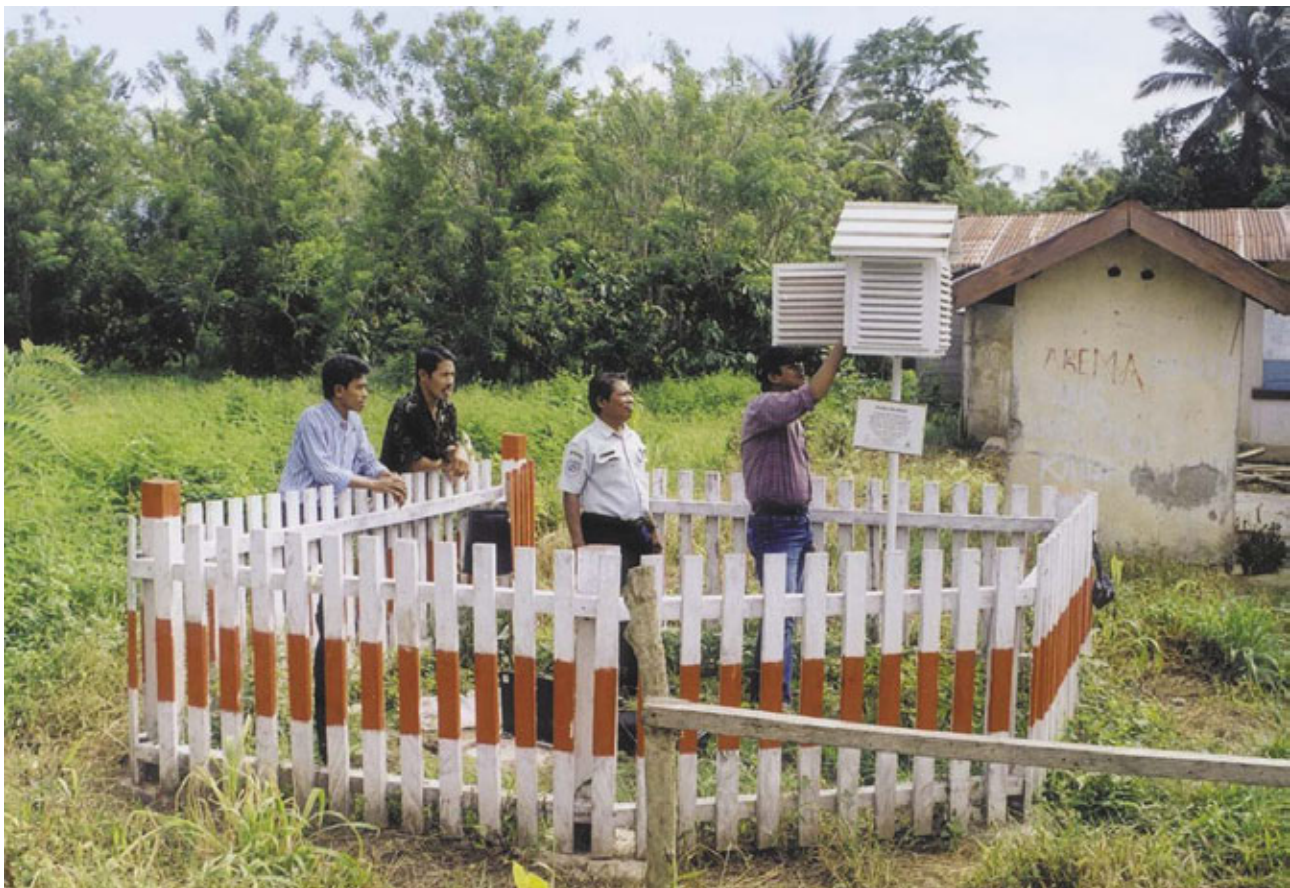
Aufnahme: Constanze Leemhuis 2003